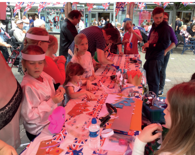
Children's crown-making activity at the Queens 90th birthday event.

The draw of the town centre parking initiative 'First Hour Free' was given a boost during the summer with Boots, Specsavers and Greggs being added to the list of businesses giving customers a discount equivalent to an hours parking. These national retailers have joined a growing number of local traders including the likes of Palmers, Cox and Son and Mocha who offer to reduce the cost of customers' parking when they spend £10 or more in their shops. The scheme operates by the production of an extra ticket by borough council parking machines which shoppers can then use in participating stores. The scheme is regularly advertised in a number of local publications and benefitted from a 12-week advertising campaign on the 'The Beach' during the Summer. More details on how the scheme works can be found on the TCP website at www.gytcp.co.uk/first-hour-free .