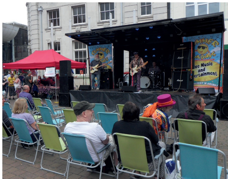
Live music on the 'Summer Sundays' stage.